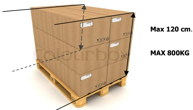
Figure 1.2. Packed EUR-EPAL

The height of the packed pallet (including the pallet itself) shall not exceed 120 centimeters. If this height is exceeded, an inserted pallet shall be used. The gross carrying capacity shall not exceed the approved carrying capacity of 800 kilograms. An agreement shall be made with DALO for items that weighs more than 800 kilograms.