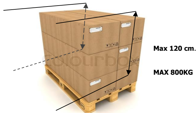
Figure 1.2. Packed EUR-EPAL

The height of the packed pallet (including the pallet itself) shall not exceed 120 centimeters. If this height is exceeded, an inserted pallet shall be used. The gross carrying capacity shall not exceed the approved carrying capacity of 800 kilograms. An agreement shall be made with DALO for items that weighs more than 800 kilograms.