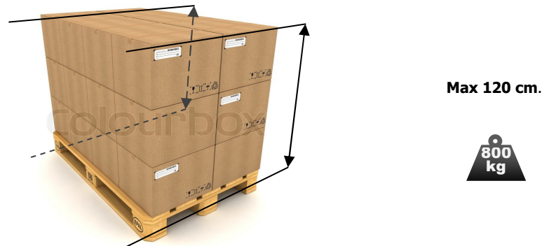
Figure 1.2. Packed EUR-EPAL